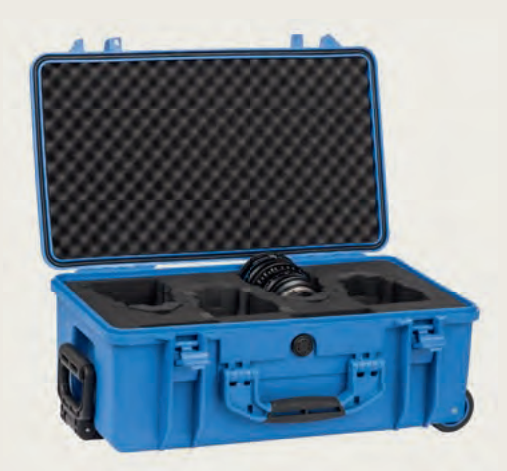
Wheeled hard case