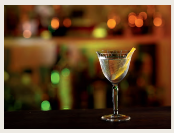
Xenon FF-Prime 100 mm

Engineering a lens from the ground up is a delicate balance of mechanics, glass and coatings. Schneider-Kreuznach's outstanding engineers have specified and selected the finest glass and applied propriety anti-reflection coatings to suppress unwanted flare. Most cinematographers agree that FF-Primes have a pleasing "film look" and the near telecentric design minimizes breathing while pulling focus.