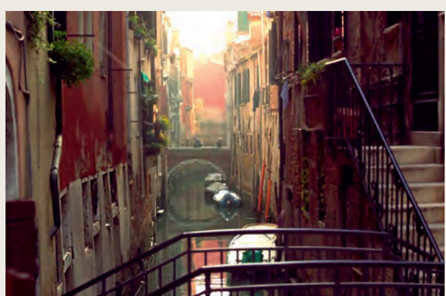
Xenon FF-Prime 50 mm

Schneider-Kreuznach offers a choice of transport solutions for the Xenon FF-Primes. Made of rock solid hard composite material, the Schneider-Kreuznach wheeled hard case features high-density foam cutouts for 4 lenses and rubberized textured handgrips to facilitate handling. Or users may prefer the individual pouches that each holds a single lens. Offering dense foam padded sides and floor, each durable fabric covered pouch zips up to secure contents within, and features a convenient carrying.