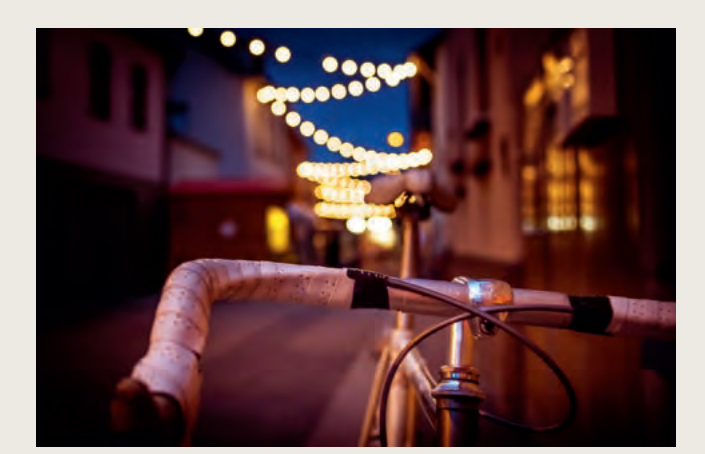
Xenon FF-Prime 35 mm

"I would describe the FF-Primes look as creamy and organic, very natural and classic."