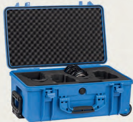
Wheeled hard case