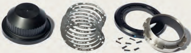
Mount kit PL