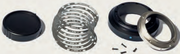
Mount kit Canon EF