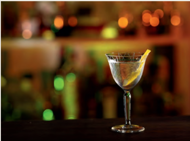
Xenon FF-Prime 100 mm

Engineering a lens from the ground up is a delicate balance of mechanics, glass and coatings. Schneider-Kreuznach's outstanding engineers have specified and selected the finest glass and applied propriety anti-reflection coatings to suppress unwanted flare. Most cinematographers agree that FF-Primes have a pleasing "film look" and the near telecentric design minimizes breathing while pulling focus.