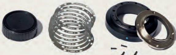
Mount kit Nikon F