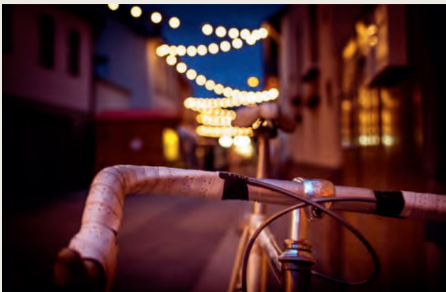
Xenon FF-Prime 35 mm