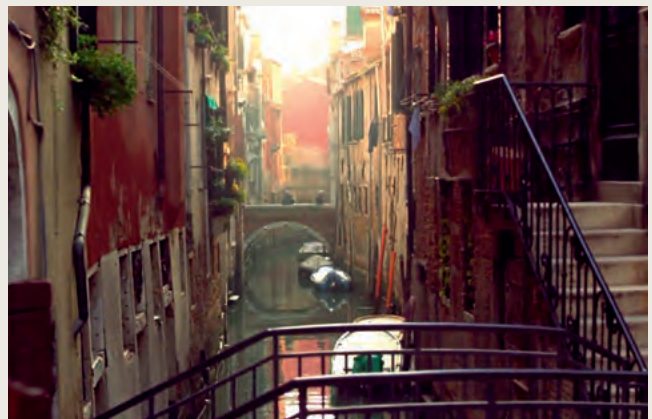
Xenon FF-Prime 50 mm

Schneider-Kreuznach offers a choice of transport solutions for the Xenon FF-Primes. Made of rock solid hard composite material, the Schneider-Kreuznach wheeled hard case features high-density foam cutouts for 4 lenses and rubberized textured handgrips to facilitate handling. Or users may prefer the individual pouches that each holds a single lens. Offering dense foam padded sides and floor, each durable fabric covered pouch zips up to secure contents within, and features a convenient carrying.